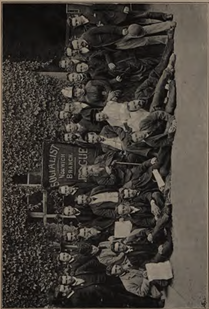
NORWICH BRANCH OF THE SOCIALIST LEAGUE.